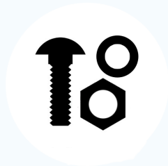
12 x 13mm bolts, nuts & washers (supplied)