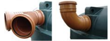
EasyFit 110mm pipe connections