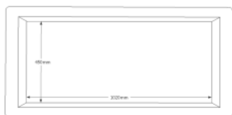
Deep spill tray

Product description: industrial strength spill tray, available in shallow and deep versions