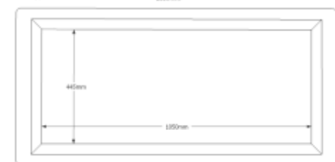
Shallow spill tray