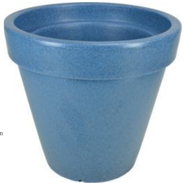
Planter shown with bowl left in