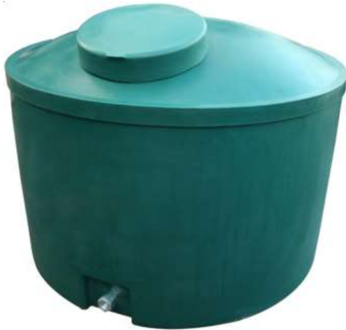
Tank shown in green and with 1" outlet

Product description: insulated cylindrical water tank, manufactured from WRAS approved polymer