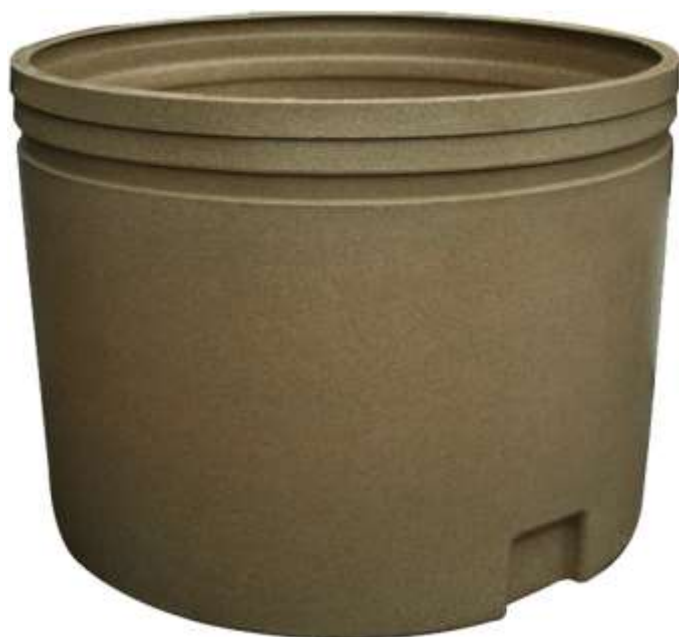
Product shown in sandstone

Product description: cylindrical open top tank, suitable for internal or external use