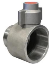
2.5" Instantaneous Twist Female to BS336 x 2" BSP Male Thread