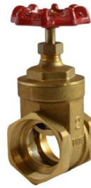
2" Brass Gate Valve