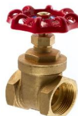
4" Brass Gate Valve