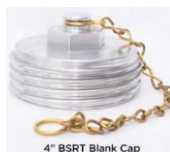
4" BSRT Blank Cap