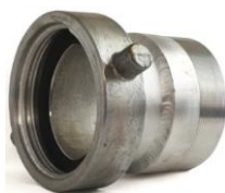
4" BSP x 4" BSRT Female Adaptor