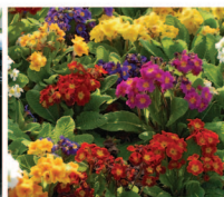
WATERING THE GARDEN