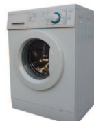
RUNNING THE WASHING MACHINE